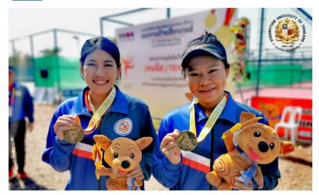
January 29, 2023