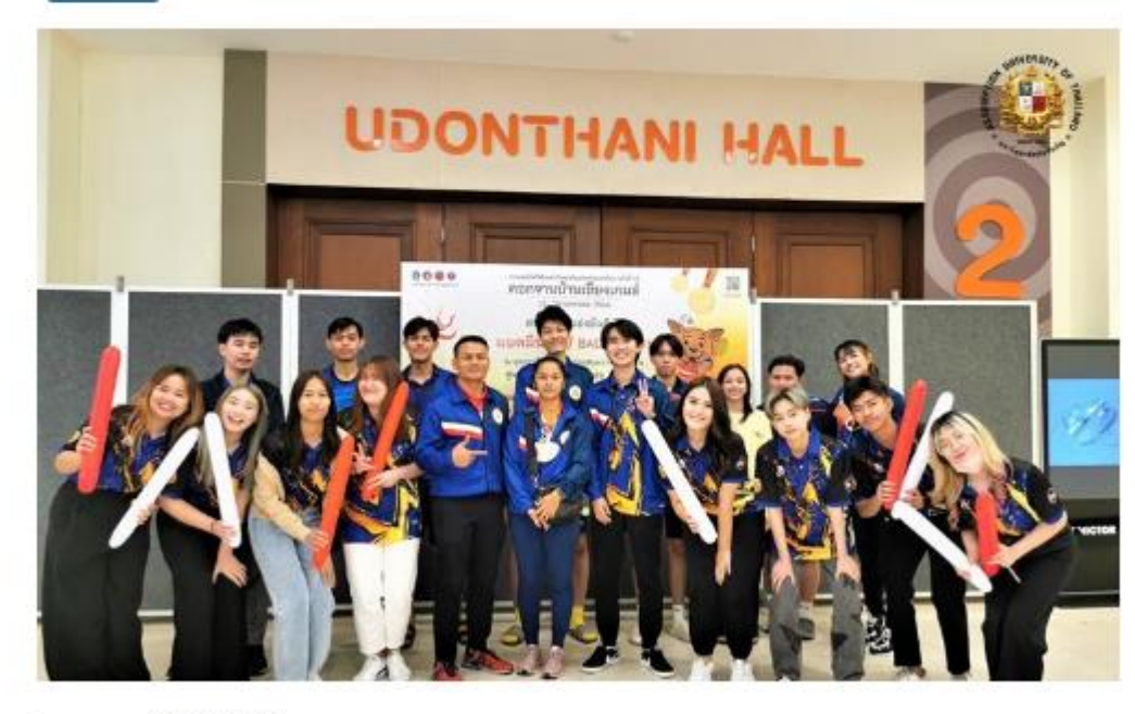
January 21, 2023