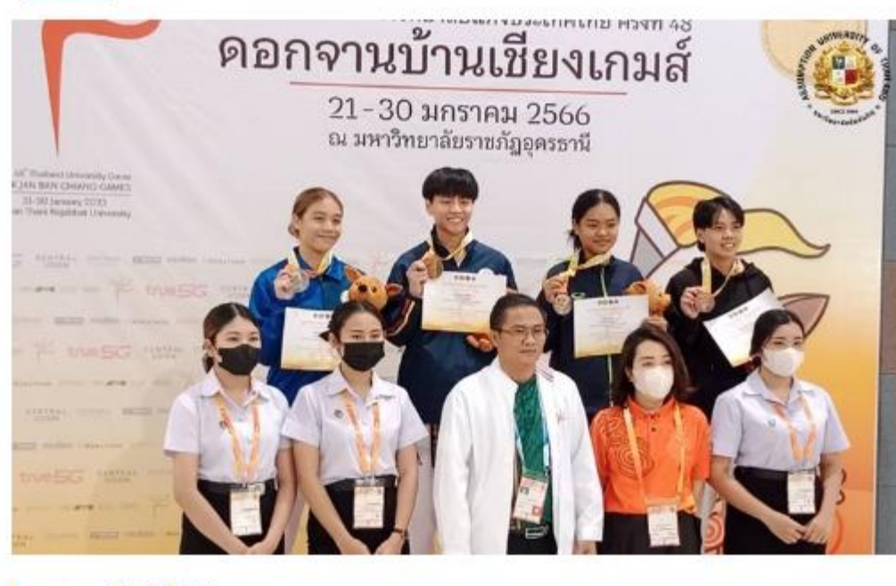
January 25, 2023