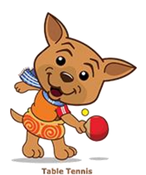
TABLE TENNIS MR.OLIVER S. Ari